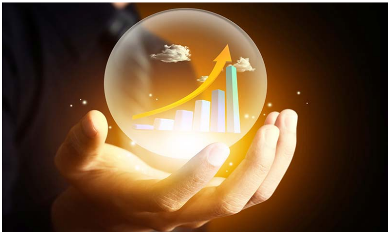
U.S. PERSONAL BANKRUPTCY RATE (2017)